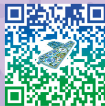
Interactive map of the Olympic Village