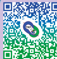
Information about the World Championship